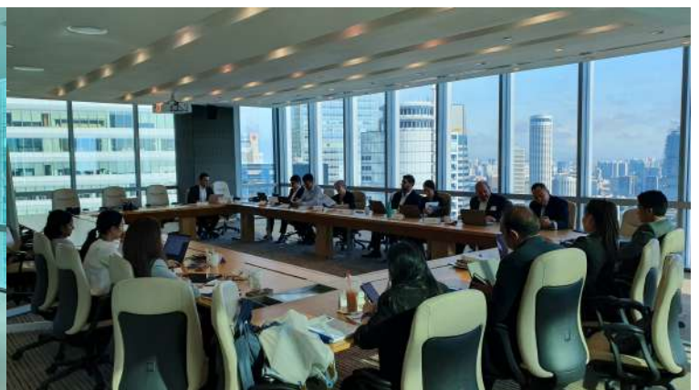
Accelerated Route to Fellowship - International Arbitration Featuring Fireside Chat with Francis Xavier SC (30 November to 2 December 2023)