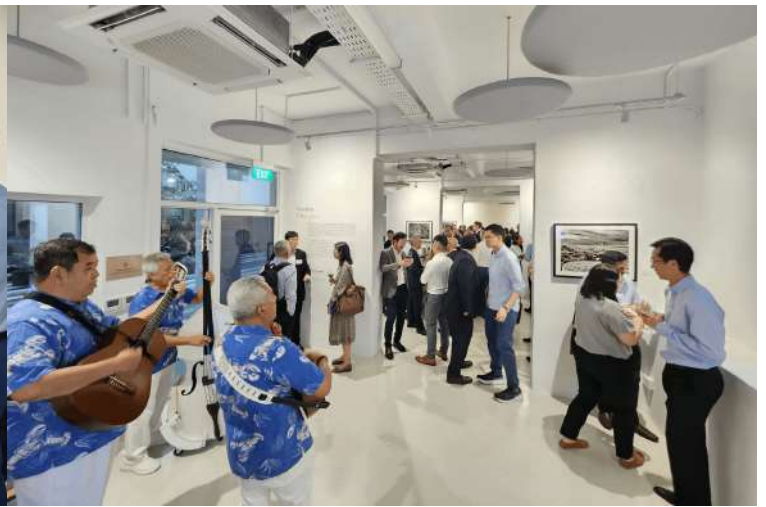
Ciarb Annual Members' Night (28 November 2023)

Click here to see more photos of Members' Night