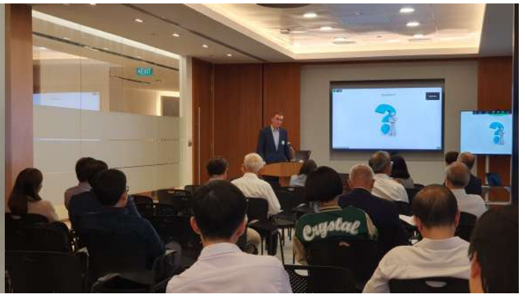
Trusts and Arbitration: a new frontier? (23 November 2023)