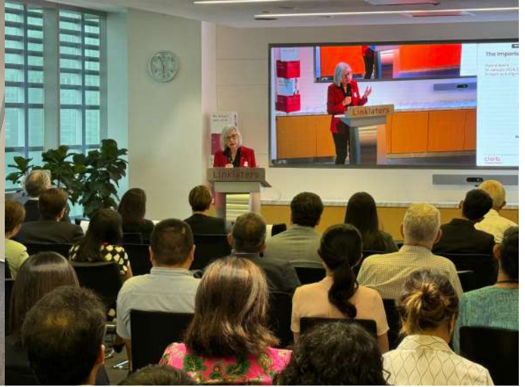
The Importance of Diversity in Judicial and Arbitrator Decision-Making (10 January 2024)