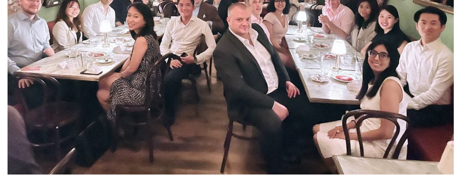
CIArb Singapore - YMG Supper Club (1 June 2023)