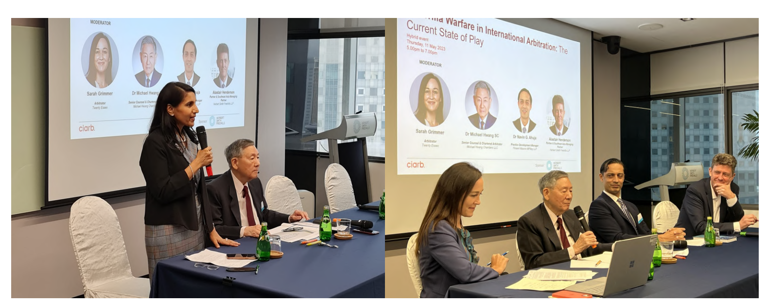
Guerrilla Warfare in International Arbitration: The Current State of Play (11 May 2023)