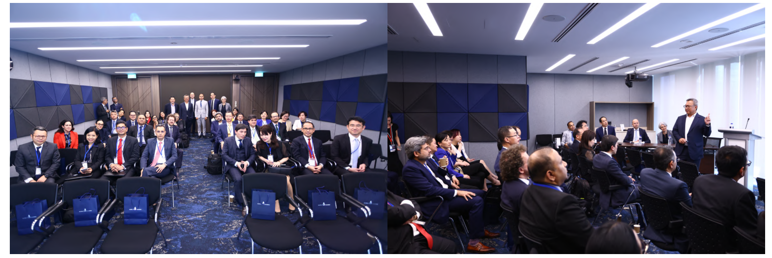
SIAC Visitor's Meeting (4 April 2023)

I include here some photos of our activities and events in the last quarter (which has been a busy one), as well as a video of our most recent webinar with Ciarb London branch on the Singapore Convention on Mediation, for which 1000 participants registered: