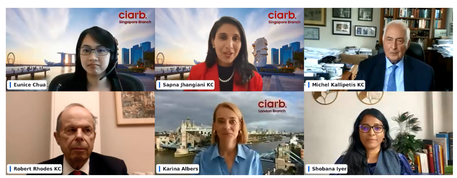
The UK's intention to ratify and sign the Singapore Convention on Mediation – an inevitable reality but what difference does it make? (21 June 2023)