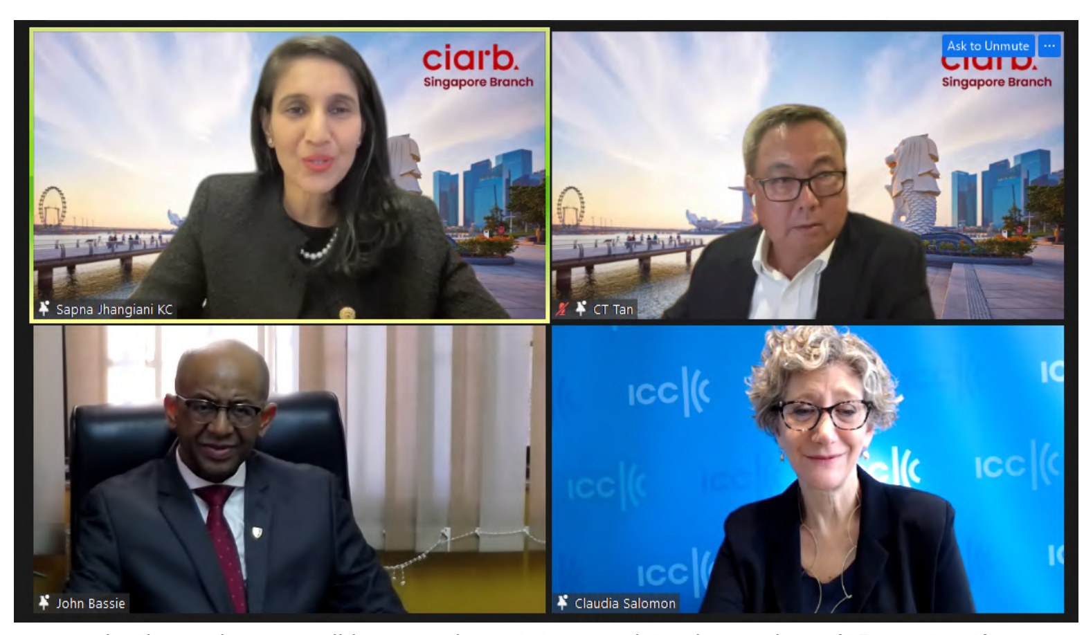
Fireside Chat with ADR Trailblazers – The ICC Court and CIArb Presidents (25 May 2023)